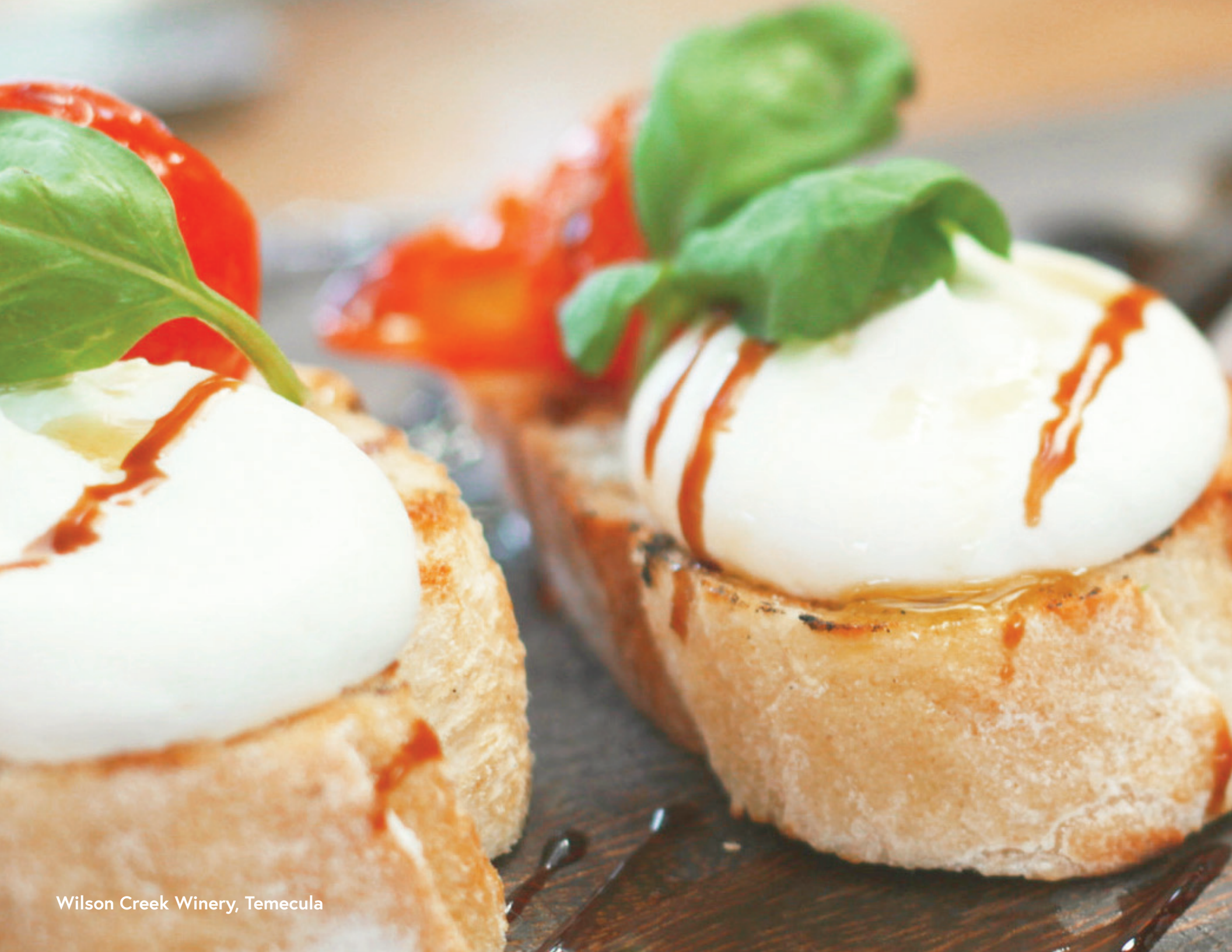
Wilson Creek Winery, Temecula